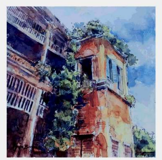
"Bhagyakul Zamindar's house 2" Pen & Watercolor by ARTIST ARUN BARMON 7X7 Inches Sep 2022 www.facebook.com/artistarunbarmon