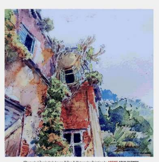
"Bhagyakul Zamindar's house T Pen & Watercolor Painting by ARTIST ARUN BARMON 7X7 Inches Sep 2022 www.facebook.com/artistarunbarmon